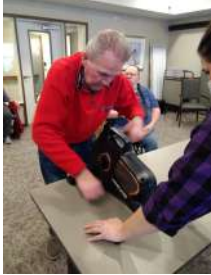
TRYathlon Arm Crank