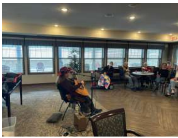
The Singing Cowgirl