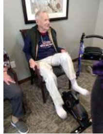
TRYathlon Leg Crank