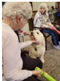
Getting some puppy love!