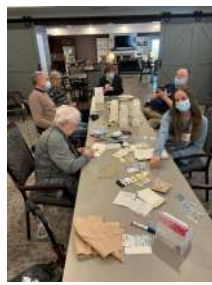
Crafting Memorial Luminaries